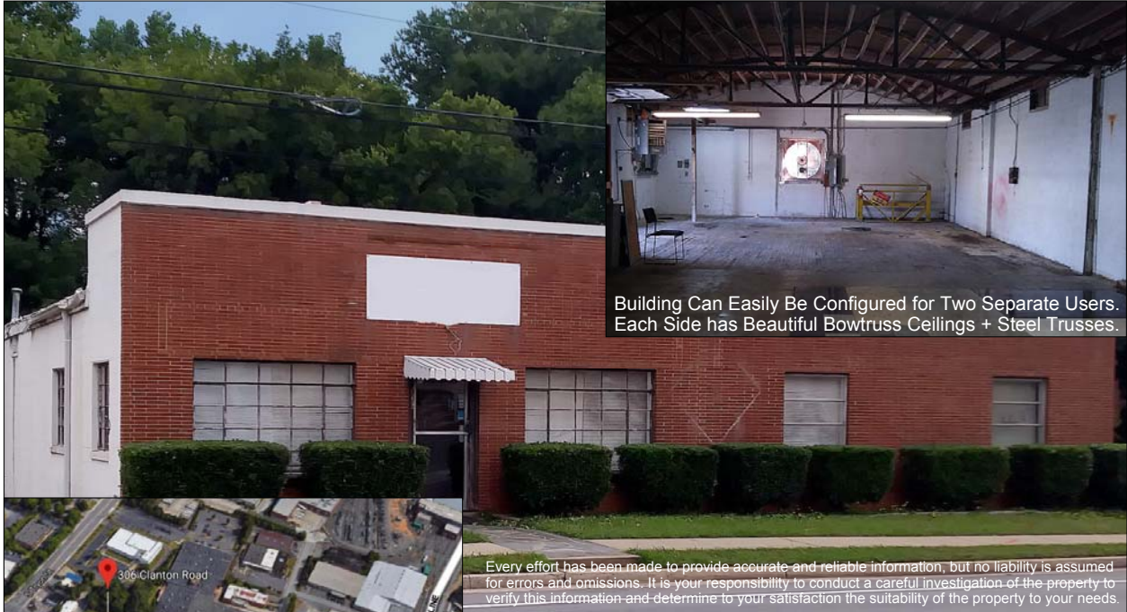
Building Can Easily Be Configured for Two Separate Users. Each Side has Beautiful Bowtruss Ceilings + Steel Trusses.

+/- 7,320tsf: Building for SALE in Lower SouthEnd (LOSO) Great Opportunity near the Rail Line (Scaleybark Stop) + 'South Village' Project!